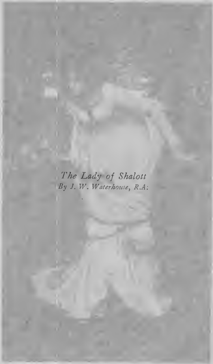
The Lady of Shalott By J. W. Waterhouse, R.A.