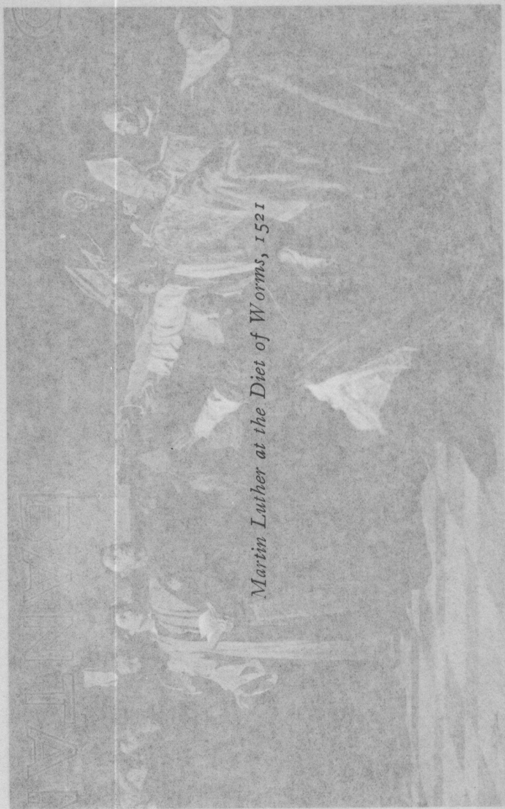
Martin Luther at the Diet of Worms, 1521