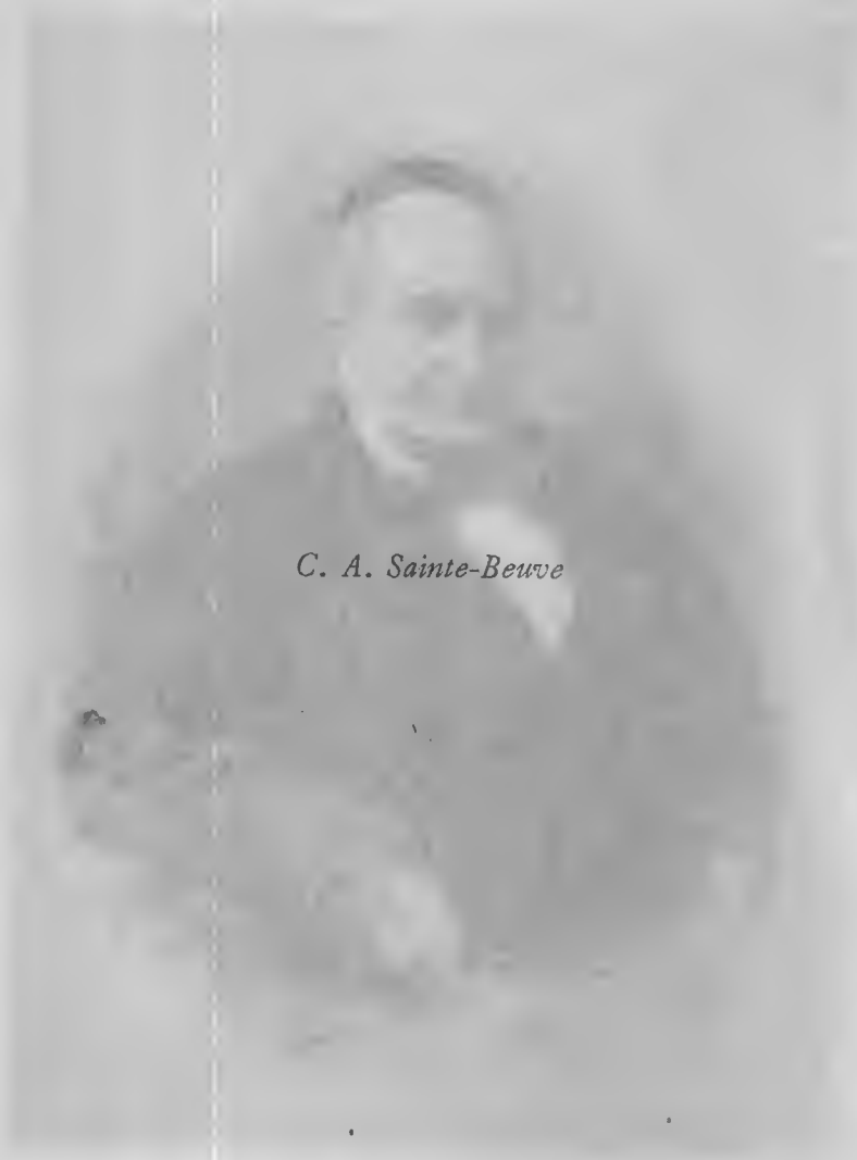
C. A. Sainte-Beuve