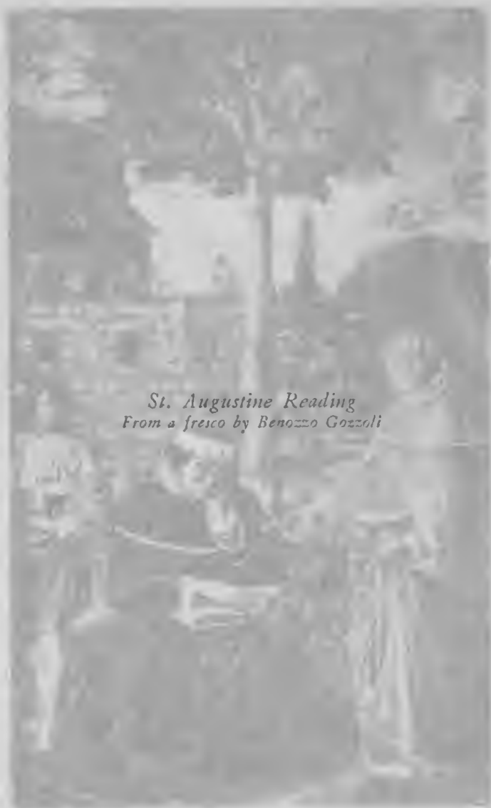
St. Augustine Reading From a fresco by Benozzo Gozzoli