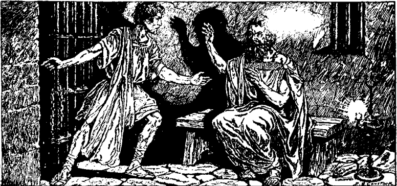
Escape from prison is offered Socrates, but his conscientious principles regarding man's relations to the laws caused him to refuse this opportunity and face the death decreed by his judges. (See Reading Assignment for June 14.)

Read: Mill's ON LIBERTY .....Vol. 25, pp. 195-203