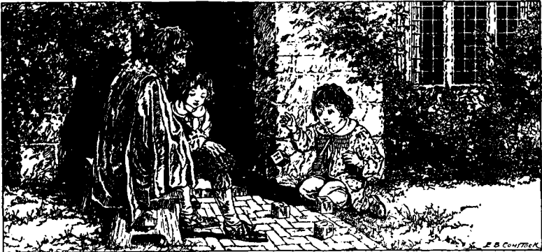
John Locke taught spelling by means of dice with letters of the alphabet pasted on them. (See Reading Assignment for October 28th.)

Read from BURNS' POEMS. . . . . Vol. 6, pp. 110-119